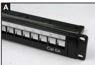
The bracket of Cat 6A patch panel.