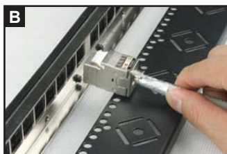
Position the shielded keystone jack for installation.