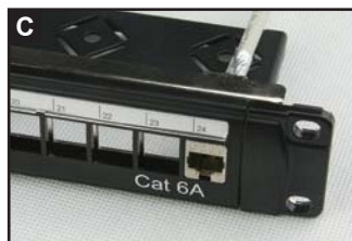
Insert the jack into the mounting location properly.